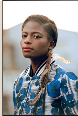
Bombé Jacket PAPA ZENO Feather Earring ANNE SINDLER Clasp Silk Nappa Rug Summer Dress LINDSEY Silver De Marine Pearl Earrings SARA P. STONE Flower Ring OLIVIERO TOSCANI