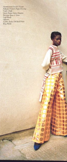
Asymmetrical Jacket NICOLA Palazzo Trousers PAPA ZENO Tights JACQUELINE Sandal Pumps GIANPAOLO Earrings SARA P. STONE Gift Tag Clasp Leather Jacket OLIVIERO TOSCANI Ring PIERRE